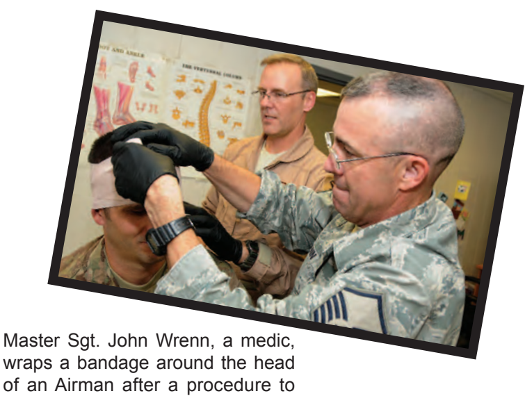
wraps a bandage around the head of an Airman after a procedure to drain an auricular hematoma on the Airman's ear, Aug. 1, 2012.