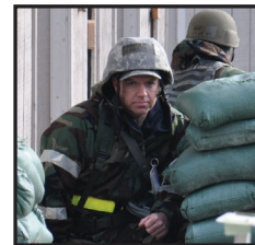
ORI prep photo show

445TH AIRLIFT WING/PA BUILDING 4014, ROOM 113 5439 MCCORMICK AVE WRIGHT-PATTERSON AFB OHIO 45433-5132