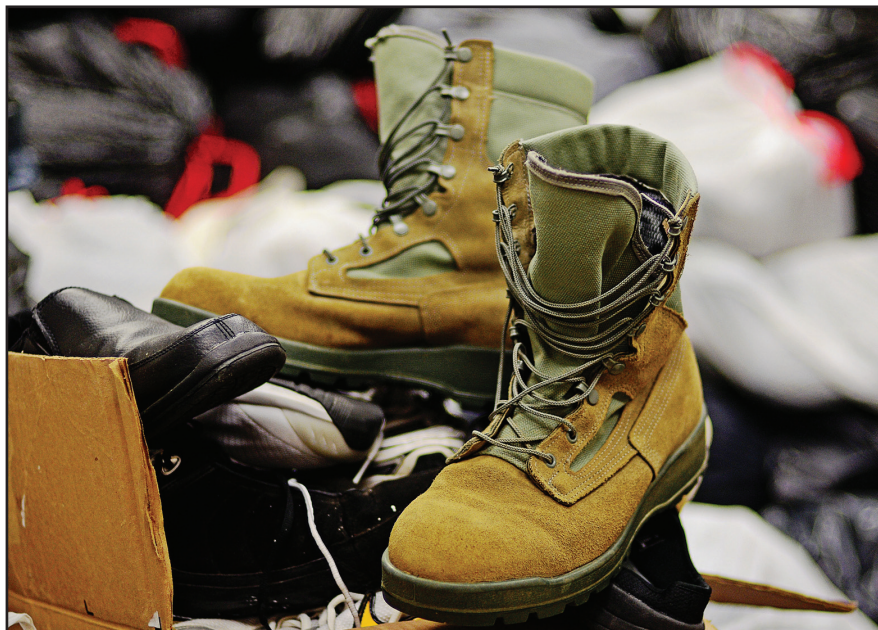
Staff Sgt. Mikhail Berlin

every day. With every passing second, children are dying because of unsafe drinking water, poor sanitation and hygiene. More than 5,000 children die each day in the world's poorest countries and more than 80 percent of all sicknesses in the world are attributed to unsafe