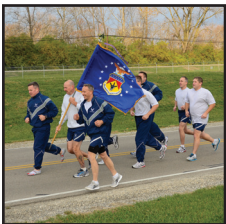
Airmen participate in CFC 5K run