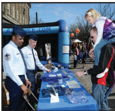
Recruiters participate in NCAA First Four festival