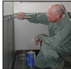
Reservists spruce up AADD facility