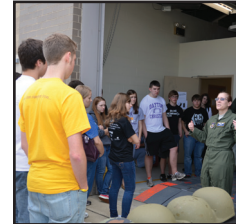
High schoolers participate in AES demonstration

445TH AIRLIFT WING/PA BUILDING 4014, ROOM 113 5439 MCCORMICK AVE WRIGHT-PATTERSON AFB OHIO 45433-5132