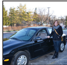
ASTS member receives car