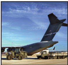
87 APS trains with K-loaders