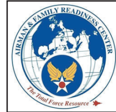
Airman's Attic gives to those in need

445TH AIRLIFT WING/PA BUILDING 4014, ROOM 113 5439 MCCORMICK AVE WRIGHT-PATTERSON AFB OHIO 45433-5132