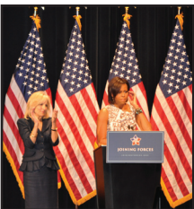
Mrs. Obama and Dr. Biden support military families