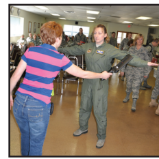
Airmen participate in mobility exercise

445TH AIRLIFT WING/PA BUILDING 4014, ROOM 113 5439 MCCORMICK AVE WRIGHT-PATTERSON AFB OHIO 45433-5132