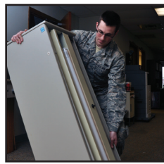
87th APS moves to building 15