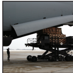
445th supports Haiti relief