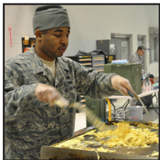
SVS prepares breakfast