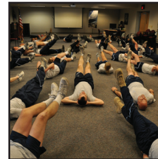
AES keeps fit during UTA

445TH AIRLIFT WING/PA BUILDING 4014, ROOM 113 5439 MCCORMICK AVE WRIGHT-PATTERSON AFB OHIO 45433-5132