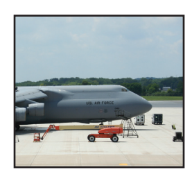
C-5 puts on a show