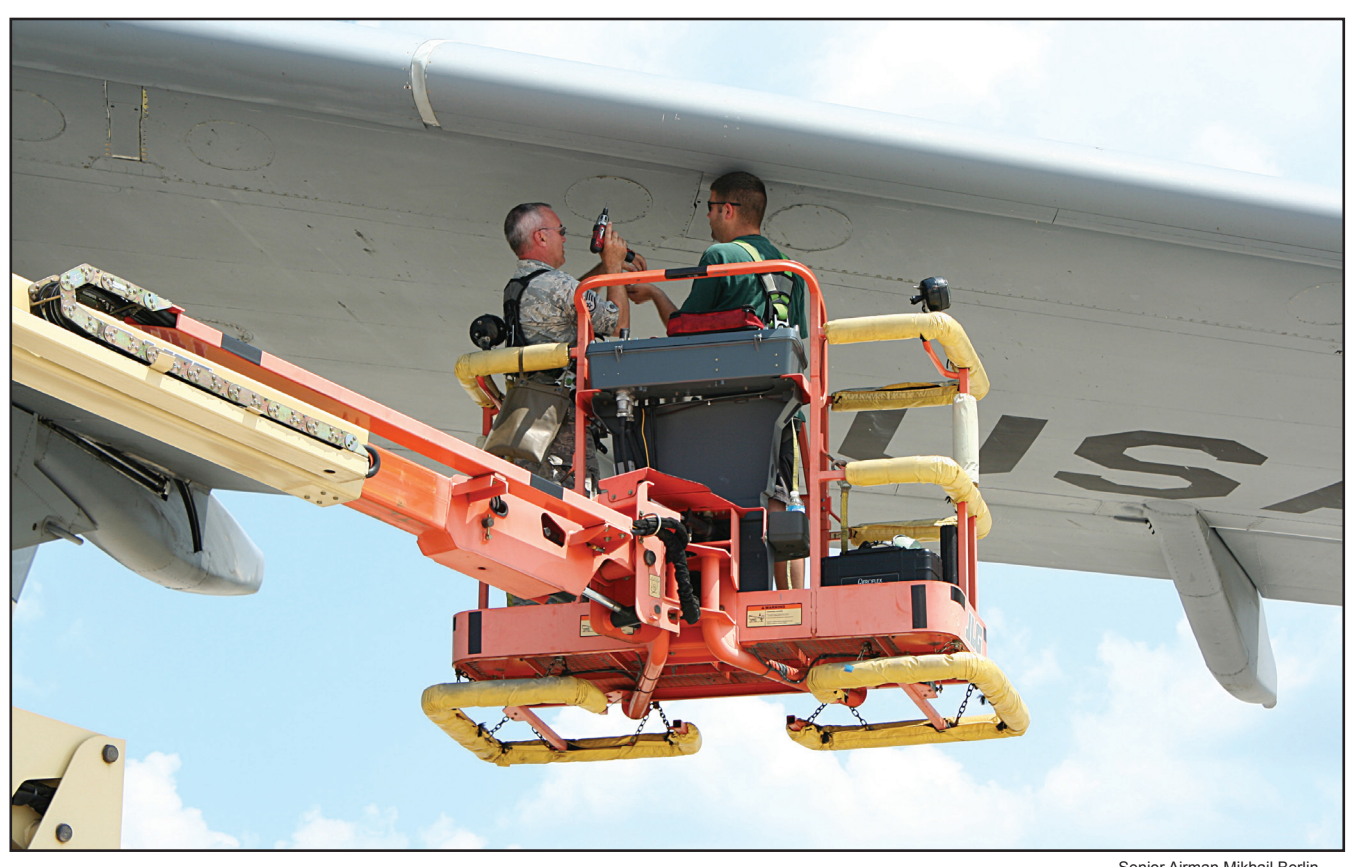
Fixing the bird