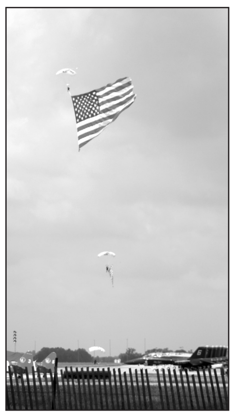
Team Fastrax skydiving team lands during the national anthem to kickoff the Dayton Air Show.