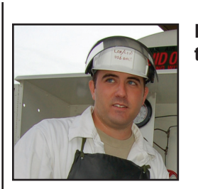
LRS Airmen train in Germany

445TH AIRLIFT WING/PA BUILDING 4014, ROOM 113 5439 MCCORMICK AVE WRIGHT-PATTERSON AFB OHIO 45433-5132