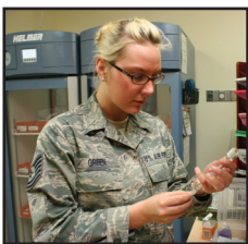
AMDS keeps unit medically fit