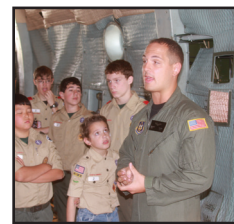
Scouting around the 445th

445TH AIRLIFT WING/PA BUILDING 4014, ROOM 113 5439 MCCORMICK AVE WRIGHT-PATTERSON AFB OHIO 45433-5132