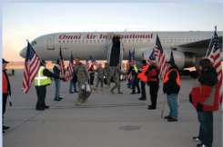
Reservist rides with Ohio Patriot Guard Riders