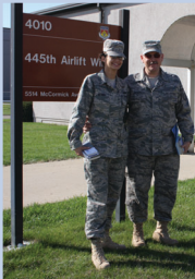
Daughter follows family path by joining military