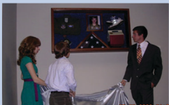
Memorial events honor late reservist