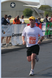
Reservist completes Boston Marathon

Check out the 445th Airlift Wing Web site for the following photos and stories . www.445aw.afrc.af.mil