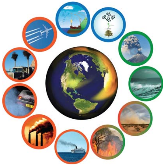
Figure 3. Highly diverse sources of atmospheric aerosols (small images). Aerosols are emitted into the atmosphere both naturally (green circles) and as a result of human activities (red circles). They also are created and modified by chemical processes in the atmosphere (blue circles). These sources vary regionally, leading to highly variable amounts of aerosols in different parts of the globe, as shown in the middle circle (pollution aerosol plume over the North Atlantic from the United States; and the natural Saharan dust over the tropical Atlantic).