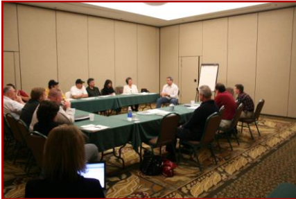
Summit Breakout Discussion

A primary Summit objective was to provide participants with a forum to share their experiences, learn from one another, and work together to begin identifying future directions. To achieve this, Summit participants were divided into breakout groups around specific discussion topics. On the first day, participants attended small group, multidisciplinary sessions focused on data. For the day-two sessions, participants were divided into three topic areas: engineering, enforcement/EMS, and education. The discussions on both days focused on: 1) what is current practice; 2) what are the gaps and obstacles; and 3) what can we do to move forward? The following highlights from each breakout session were presented to the full Summit (a detailed collection of participant comments from the breakout sessions is available in Appendix C).