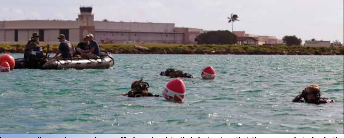
Singapore sailors and reconnaissance Marines signal to their instructors that they are ready to begin the underwater dive portion of a training evolution during Exercise Sandfisher 2013 on Marine Corps Base Hawaii Jan. 9. The sailors are with the Singapore Armed Forces' Naval Diving Unit. The Marines are with 3rd Reconnaissance Battalion, 3rd Marine Division, III Marine Expeditionary Force.