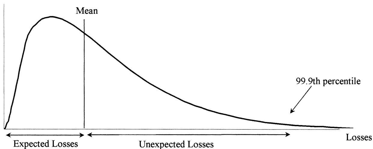
Figure 1 – Probability Distribution of Potential Losses

The area under the curve to the right of a particular loss amount is the probability of experiencing losses exceeding this amount within a given time horizon. The figure also shows the statistical mean of the loss distribution, which is equivalent to the amount of loss that is "expected" over the time horizon. The concept of "expected loss" (EL) is distinguished from that of "unexpected loss" (UL), which represents potential losses over and above the EL amount. A given level of UL can be defined by reference to a particular percentile threshold of the probability distribution. For example, in