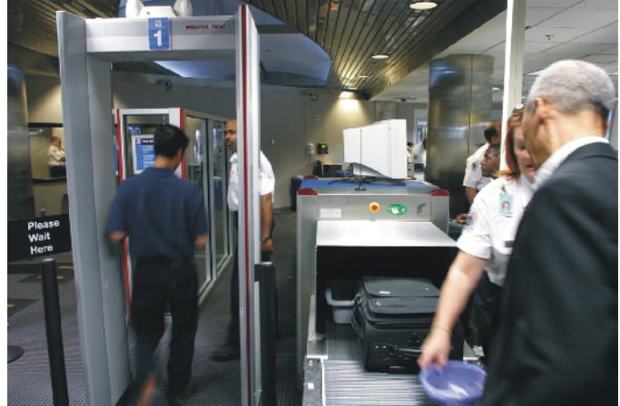
Passenger screening is more efficient and effective at every checkpoint in the country as a result of better training, pay, and improved accountability.