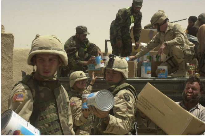
Soldiers deliver food and supplies in Afghanistan.

The United States has been encouraging other donors to increase their reconstruction and humanitarian assistance to Afghanistan. At the donors conference in January 2002 in Tokyo, the international community pledged $4.5 billion for Afghanistan, including humanitarian and reconstruction assistance. Donor pledges varied from one to five years. Since then, additional pledges have pushed the total commitment to $5 billion.