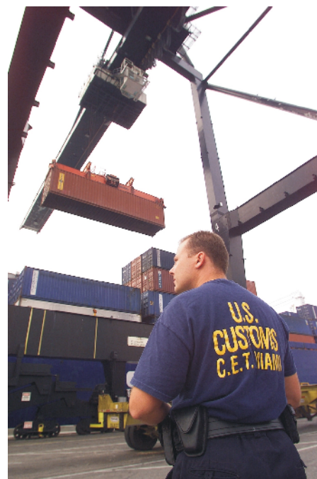
A customs inspector oversees the unloading of cargo containers from a ship at the Miami seaport.

Building on the border initiatives to date, the 2004 Budget includes $480 million to continue building a comprehensive system to track both the entry and exit of all visitors to the United States. In addition, about $120 million in new funding is provided to support technology investments along the border, including radiation detection machines to inspect cargo containers.