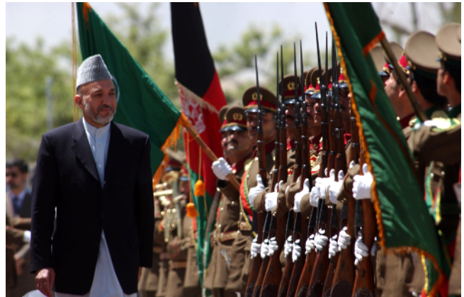
President Karzai reviews the first soldiers of the Afghan National Army.

The President's 2004 Budget provides the resources to help us meet these challenges. The budget requests significant funding for programs across the federal government that contribute to the war on terrorism and protection at home. The budget provides approximately $2.3 billion in assistance to countries that have joined us in the war on terrorism. The Economic Support Fund provides grant assistance to countries such as Afghanistan and Pakistan. The Foreign Military Financing Program provides equipment, training and defense services. These and other anti-terrorist programs are described in more detail in the chapter on the Department of State and International Assistance Programs.