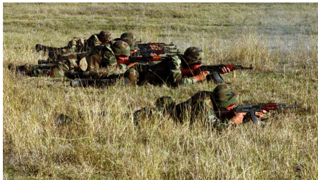
Georgian soldiers take aim in the Georgia Train and Equip Program.