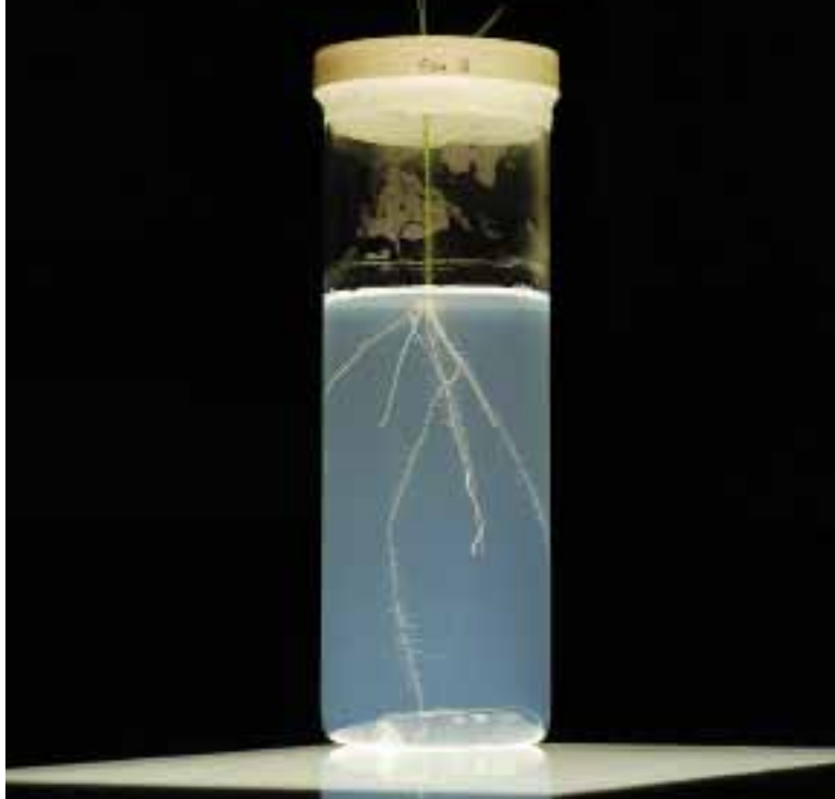
Azucena rice, an upland cultivated variety, growing in a growth cylinder system used to capture the dynamic growth of root systems in three dimensions.

With computers and digital photography, researchers have even developed two- and three-dimensional imaging systems to record roots as they develop in the transparent gels.