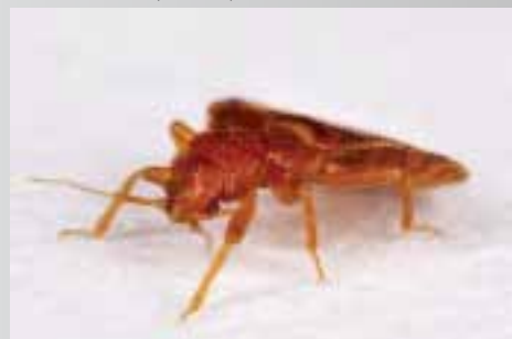
Above: An adult bed bug, Cimex lectularius , is roughly 4 mm in length. Immature and adult bugs are very flat, making it easy for them to hide in cracks and crevices.