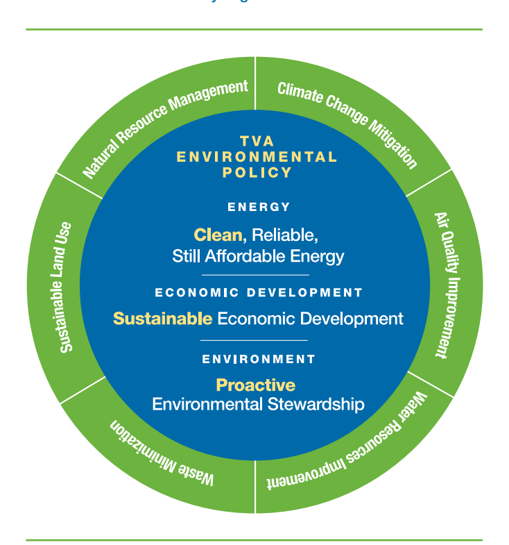
EXHIBIT 1 Overall Environmental Policy Alignment With TVA's Mission

In this context, the Environmental Policy directly aligns with the threefold TVA mission of Energy, Economic Development and Environment, and, as shown in the center of Exhibit 1, accents and integrates environmental leadership into all aspects of the TVA mission.