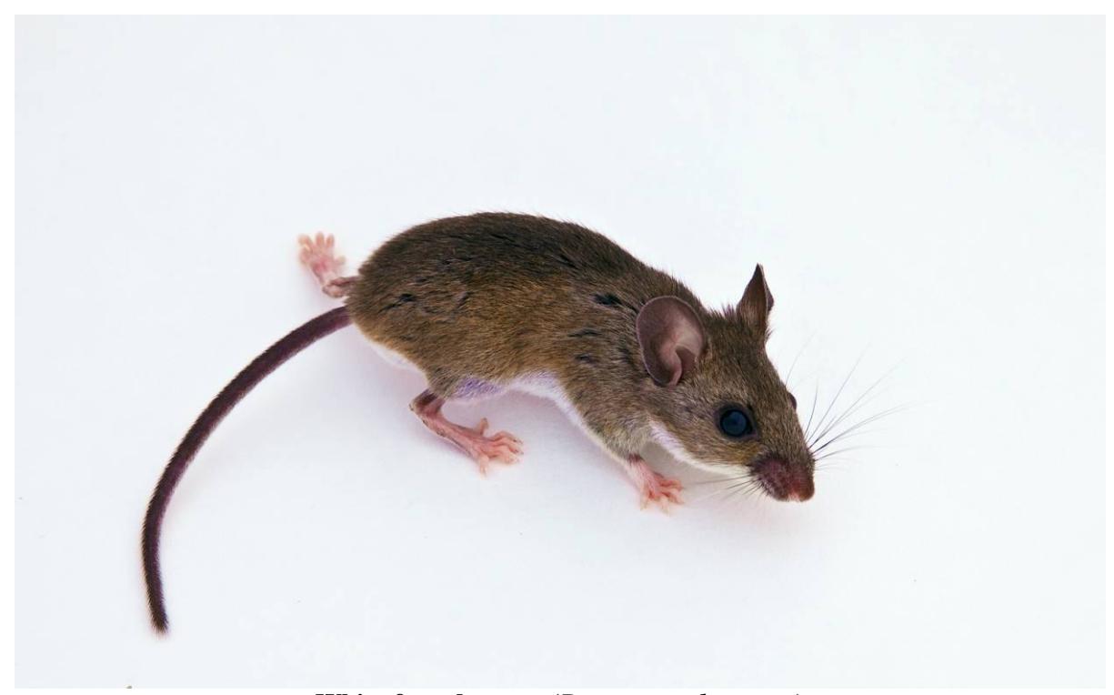
White-footed mouse ( Peromyscus leucopus )