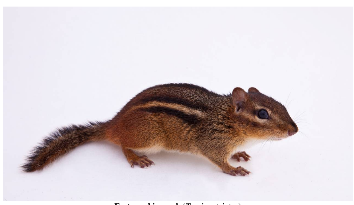
Eastern chipmunk ( Tamias striatus )