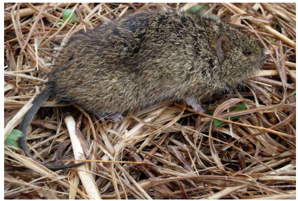
Hispid cotton rat (Sigmodon hispidus)