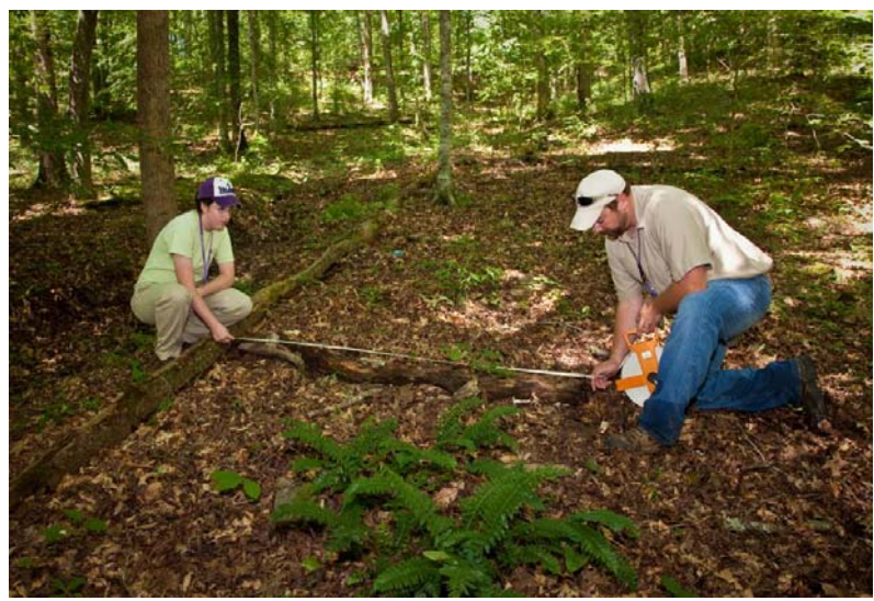
Measurement of log length during CWD sampling

d = diameter of the log (Parminter 1998).