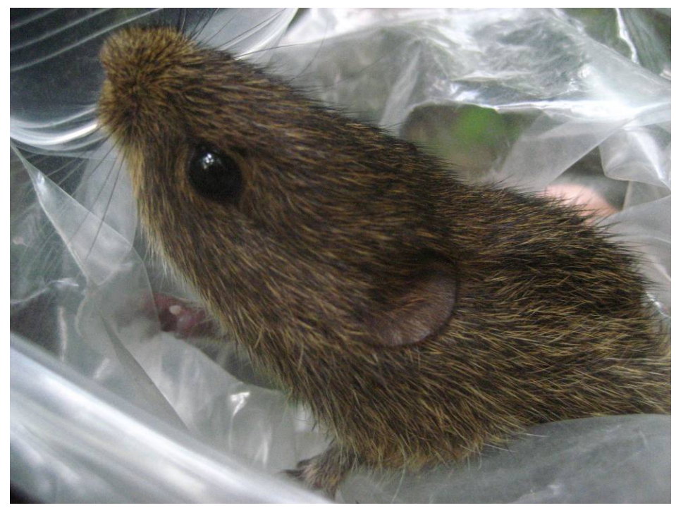
Woodland vole ( Microtus pinetorum )