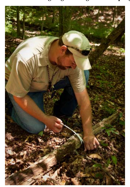
Measurement of log diameter during CWD sampling