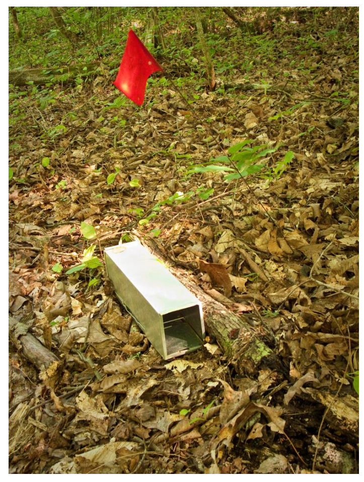
\label{eq:Fig.2.} \textbf{Fig. 2. Sherman live trap setup.} \ \ \text{Photograph courtesy of } \\ \text{Ron McConathy.} \\