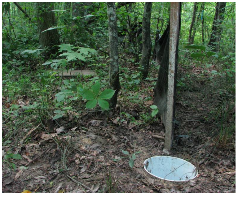
Fig. 3. Pitfall trap with drift fence array.