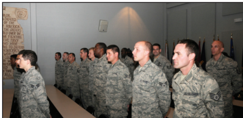
Below: Airmen of the 121st Civil Engineering Squadron receive awards for their recent deployment to Afghanistan