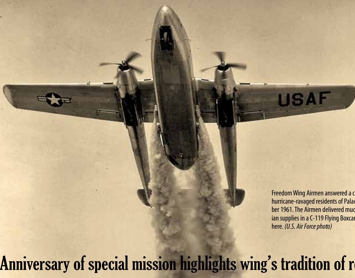
Freedom Wing Airmen answered a call for help from hurricane-ravaged residents of Palacios, Texas, in September 1961. The Airmen delivered much-needed humanitarian supplies in a C-119 Flying Boxcar, like the one pictured here.