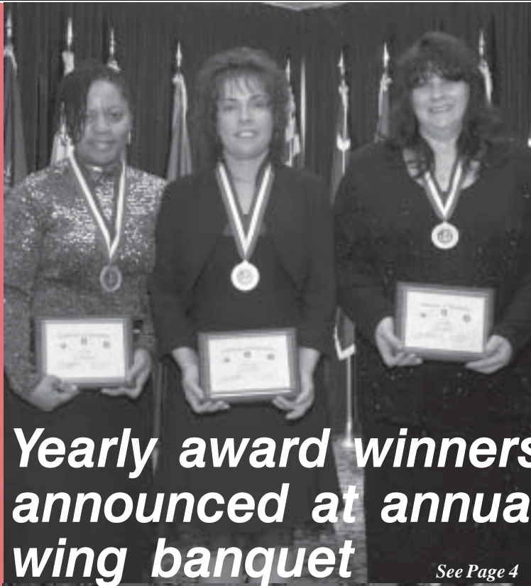
Yearly award winners announced at annual wing banquet

514th Air Mobility Wing, Air Force Reserve, McGuire AFB, NJ