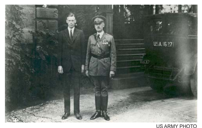
Charles Lindbergh with Col. David King, then Arsenal commander, during August 1927 visit.

While the interior of the residence is in fairly good condition, the limestone exterior walls need extensive repair, as do many of the ornamental features on the exterior. Repairs need to be performed on the roof as well. To meet modern standards, work would need to be done to make Quarters One accessible to the physically disabled. Compounding the expense