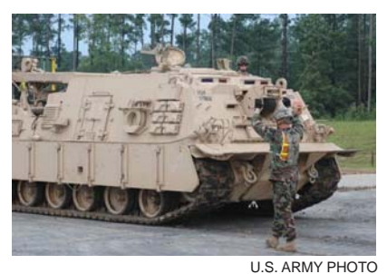
A 1st Cav M88 recovery vehicle.

Our team has made the local Reset Program for the M88 Recovery Vehicle our flagship operation, as this program has continued to improve since it began. The Directorate of Logistics maintainers operate the program with one of their contract teams and the team is meeting and/or exceeding their monthly production goal.