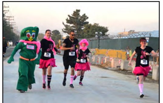
RIA celebrates Hispanic Heritage Month