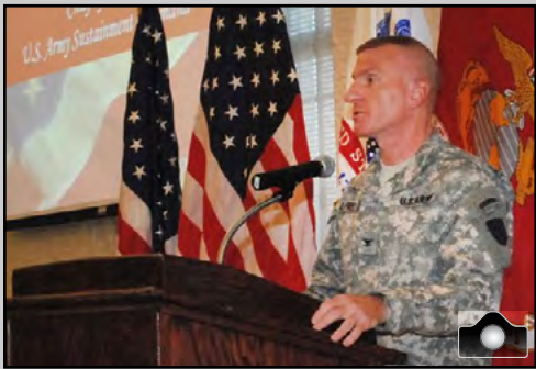
ASC supports RIA Military Retiree Appreciation Day