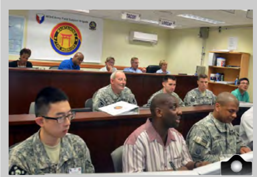
403rd AFSB participates in Exercise Ulchi-Freedom Guardian 2012