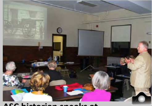
ASC historian speaks at Philanthropic Educational Organization meeting