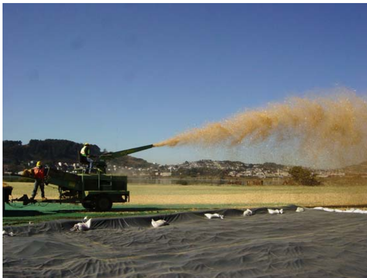
Hydro-seeding at the Former PCB Hot Spot Area