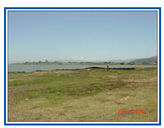
Metal Slag Prior to Excavation (Before)