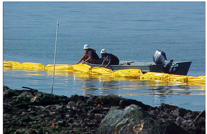
Silt Curtain Installation at Metal Debris Reef