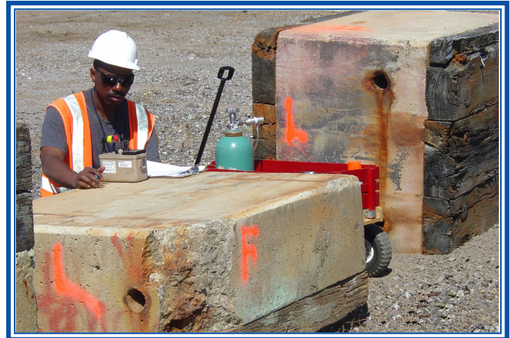
Keel Block Survey