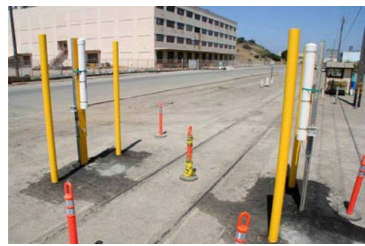
Portal Monitors at Parcel D