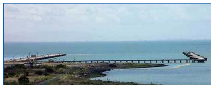
Silt Curtain Installation Complete