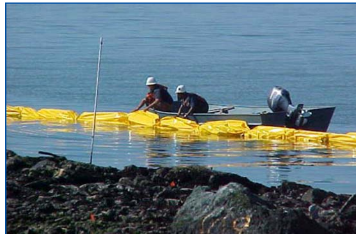
Silt Curtain Installation at Metal Debris Reef