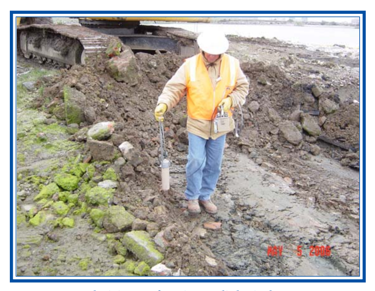
Technician Performing Radiological Scan While Excavating at Parcel E