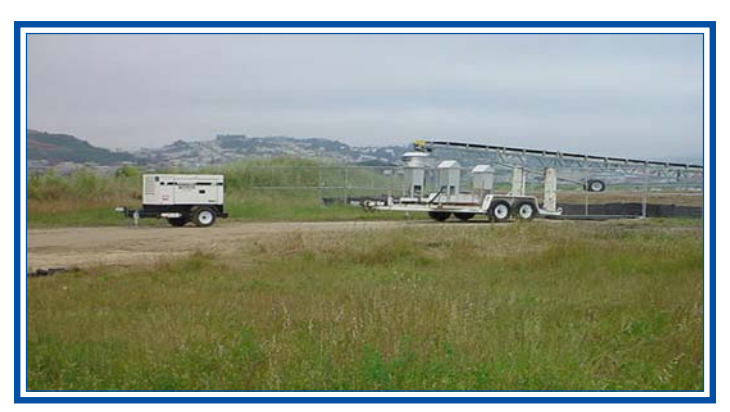
Air sampling equipment in place at IR-02