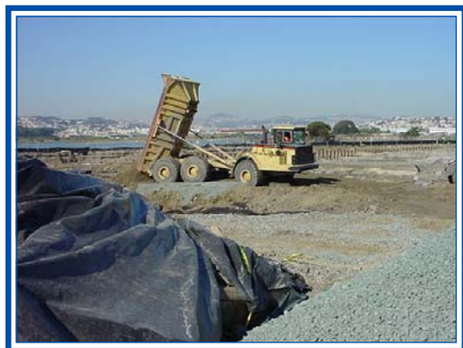
Backfilling Portions of the PCB Hot Spot Area