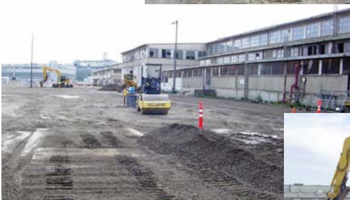
Backfilling Trenches in Parcel B