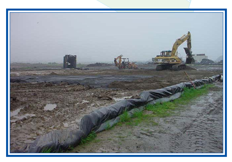
Improvements to Dewatering Pad for Metal Surveys

• Continue to prepare the draft Feasibility Study Report for Parcel F.