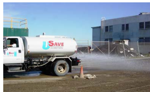
Water truck performing dust control