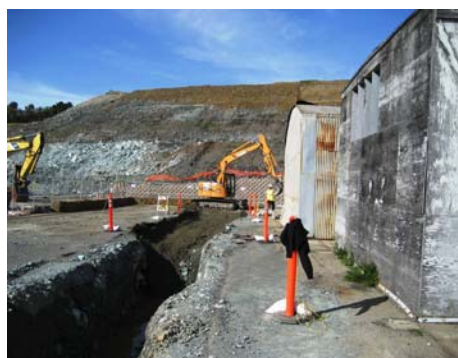
Backfilling in Parcel B