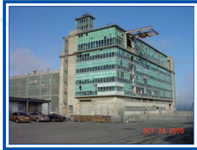
Building 253 - Parcel C