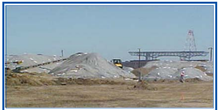
Covered Stockpiles - Parcel E-2