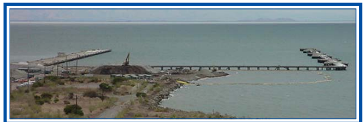
Metal Reef Area - Parcel E