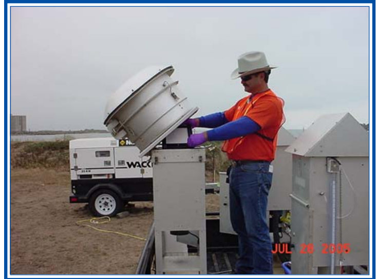
Air Monitoring - Parcel E-2