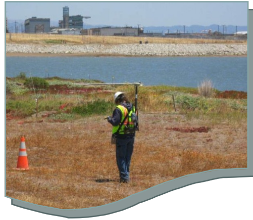
Radiological technicians conducted surveys of the Ship Shielding Area before excavation

Cleanup Plans for summer 2012 include excavation and removal of the Shielding Range and related features, radiological screening of excavated soil and removal to an off-site facility equipped for processing radiological wastes.