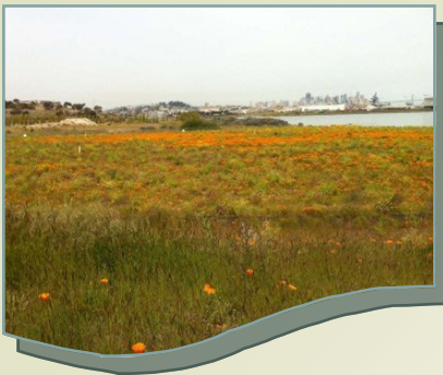
Parcel B with new native plantings

The Navy cleaned up a 14-acre site in the western portion of Parcel B through removal of concrete, metal debris and contaminated soil. Clean soil was then placed at the site and the area was planted with native wildflowers and grasses. In addition, approximately 1,000 feet of shoreline was reinforced with large rocks.