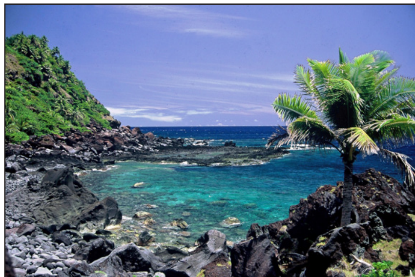
Asuncion's beautiful azure lagoon (Islands Unit)

The Western Pacific Fishery Management Council and NOAA National Marine Fisheries Service, with consideration of input from the public, are in the process of adopting non-commercial fishing regulations for the Islands Unit of the Marianas Trench MNM, in consultation with the Service.