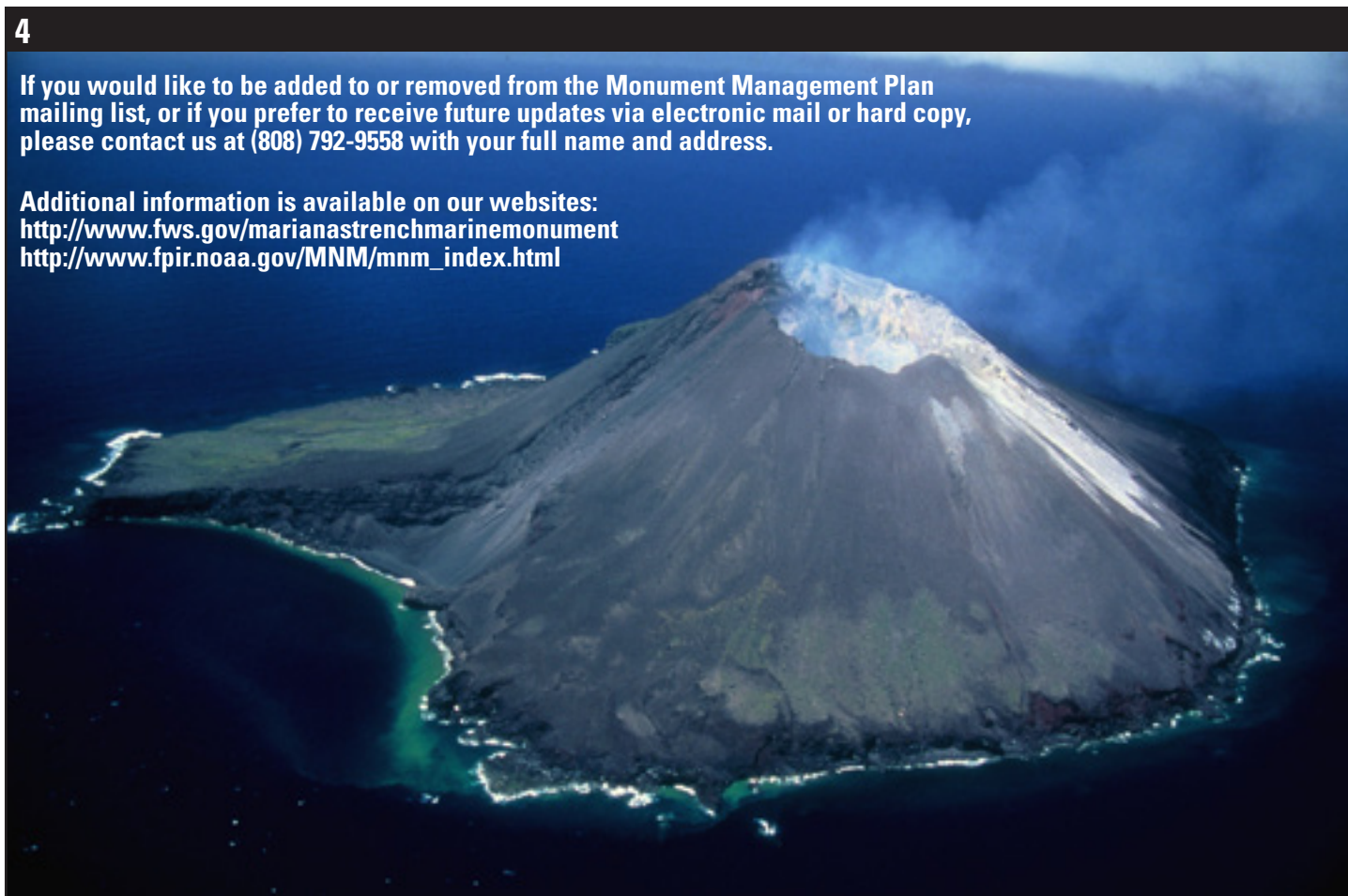
Farallon de Pajaros (Bird Rock) is the northernmost island in the Marianas archipelago.

Additional information is available on our websites: http://www.fws.gov/marianastrenchmarinemonument http://www.fpir.noaa.gov/MNM/mnm_index.html