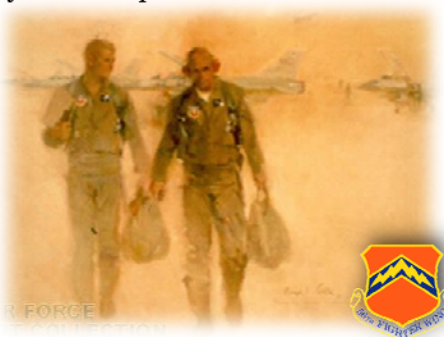
Below: Two pilots leave the flightline with F-16 “Fighting Falcon” jets at MacDill. The base was home to fighter aircraft from 1962 up to 1993.