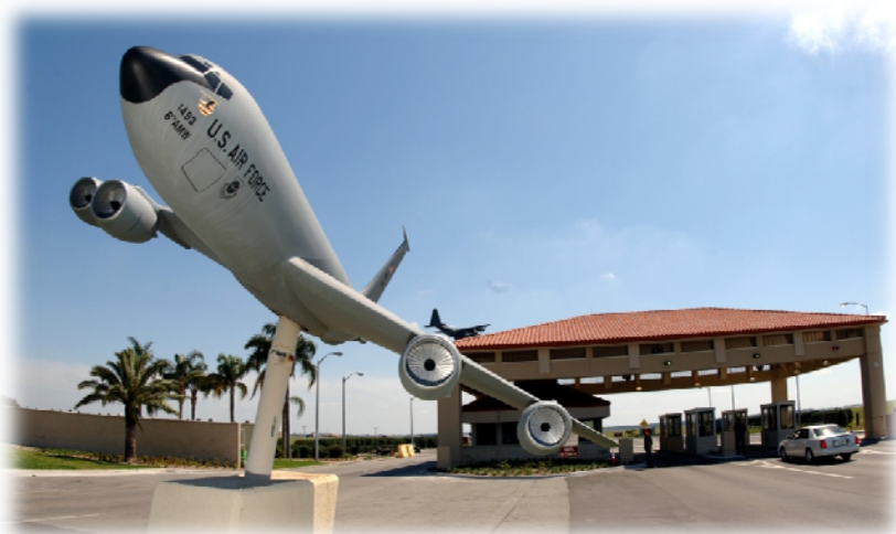
Left: A jumpmaster of U.S. Special Operations Command (at MacDill) directs parajumpers aboard a C-130 "Hercules." Right: A model of the KC-135 "Stratotanker" greets visitors at the front gate of MacDill Air Force Base.

In 2008, the base wing experienced more changes as part of a major restructuring by the Air Force. This time, MacDill and the 6th welcomed the Air Force Reserve's 927th Air Refueling Wing as a joint partner in the aerial refueling mission at MacDill. Currently, these two units – one active duty and the other reserve – work together using the same KC-135 "Stratotankers" to more efficiently carry out the Air Force's missions. Today at MacDill, the 6 th Air Mobility Wing performs aerial refueling, airlift, and contingency response missions for U.S. and allied forces around the world. The wing has sixteen KC-135 "Stratotankers," three C-37A aircraft, and more than 2,700 personnel assigned. Additionally, the 6th Air Mobility Wing is the host unit of MacDill Air Force Base and provides direct support to U.S. Central Command, U.S. Special Operations Command, and 39 other tenant units.