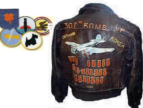
Above: Unit patches and a bomber jacket from the 307th Bombardment Group at MacDill in the early 1950s.

In 1963, the bombers gave way to the fighters when MacDill became a Tactical Air Command training base. Throughout the Vietnam War and up until the first Gulf War in 1991, Tampa became a home for the F-4 “Phantoms” and later the F-16 “Fighting Falcons.” Between 1979 and 1993 approximately half of all F-16 pilots trained at MacDill.