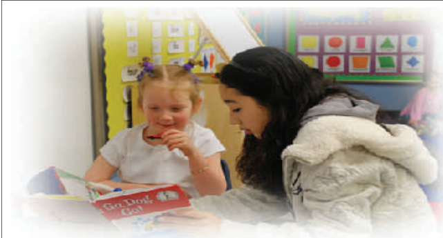
Life at Osan Middle School