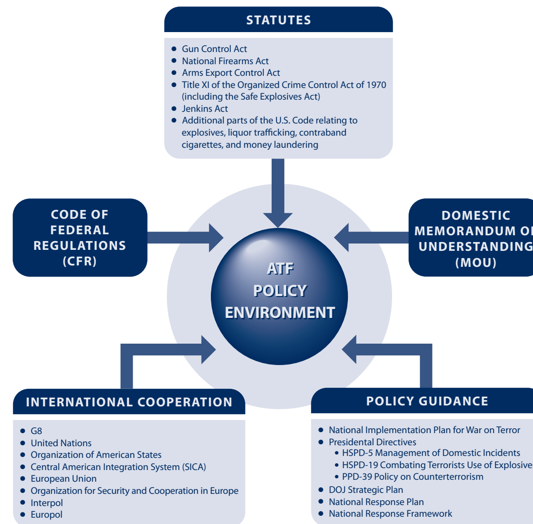
Figure 6: Policy Environment for ATF Strategy

In accordance with Presidential Directives, ATF will continue to play a key role in shaping the national response to domestic incidents and coordinating efforts with partners to ensure safety for all Americans.