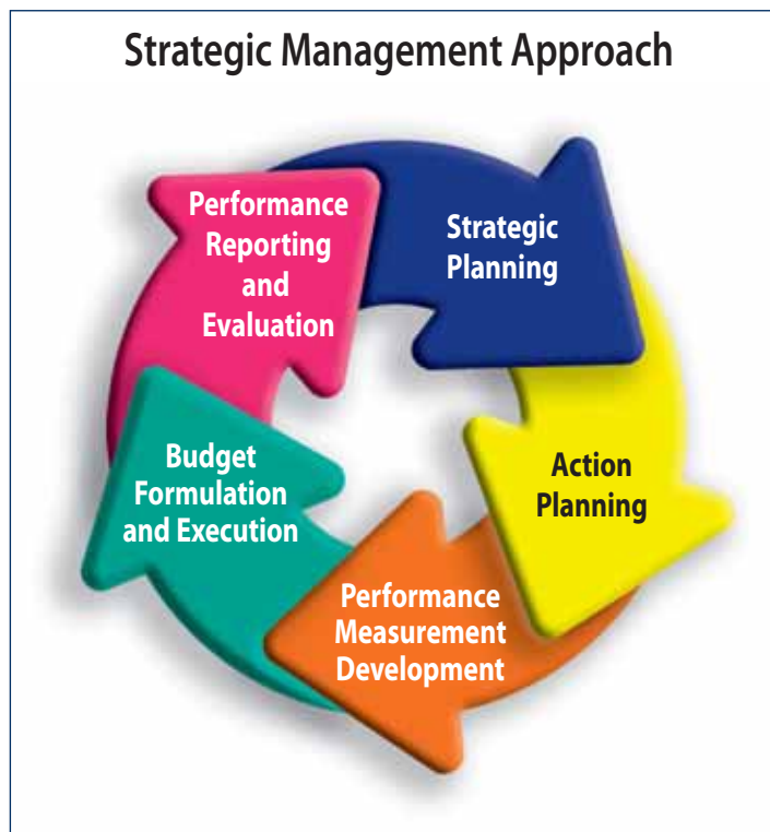
Figure 5: Strategic Management Approach

Strategic Management Approach. The Office of Strategic Management (OSM) facilitated the development of this Strategic Plan, which is an ongoing Bureauwide effort. Key players in this endeavor include members of the Strategic Leadership Team (SLT), which consists of ATF's Director, Deputy Director, Assistant Directors, and Deputy Assistant Directors. In addition, cross-functional Strategic Priority Action Committees (SPACs), comprised of senior level managers and subject matter experts, developed the strategic objectives and strategies linked to the strategic goals. Internal stakeholders at