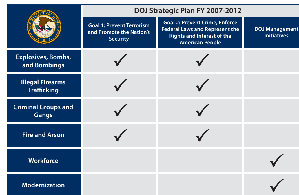
Figure 4: Alignment to DOJ Strategic Plan

As a critical component of DOJ, ATF shares this vision and dedication to the American people and is committed to meet the strategic goals set forth by DOJ. Furthermore, in accordance with the DOJ Management Initiatives and Human Capital guidance, ATF will focus its resources and attention on business modernization and workforce strategies. The figure below illustrates the alignment of ATF's strategic goals with DOJ's strategic goals.