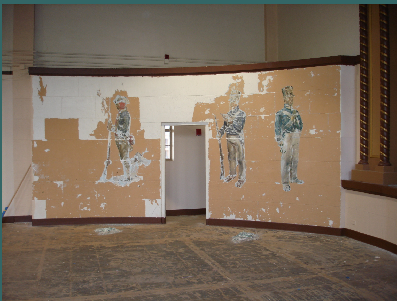
Further investigation revealed figures that are estimated to have been painted between 1932 and 1933, and later updated in the 1950s.

Quad F is the only quad that retains its original theater, including classical columns, carved medallions, decorative wall moldings, and a coffered ceiling decorated with stenciled wood paneling. These features were restored in preparation for the Centennial Celebration of Schofield Barracks in 2009.