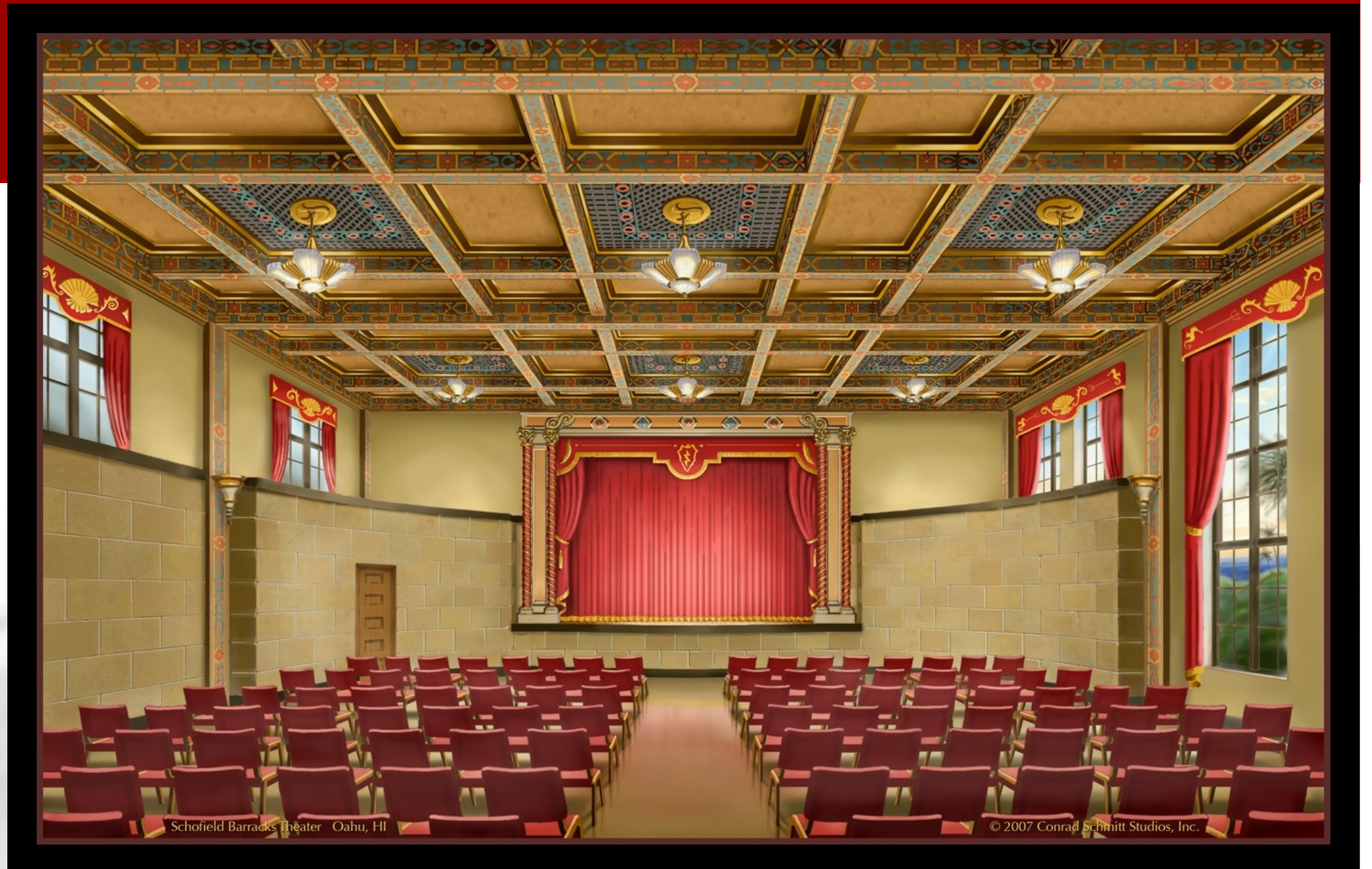
Rendering of original appearance of theater, before discovering the paint-covered mural

All the quadrangle barracks were constructed with theaters for troop entertainment on weekends. The theaters provided movies and live entertainment by local bands as well as periodic balls. Most of the theaters in the quads were converted to gymnasiums during the late 20 th century.