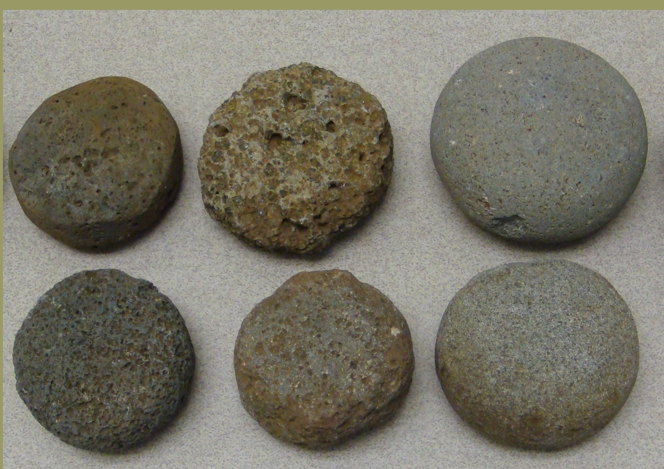
`ulu maika (game pieces)