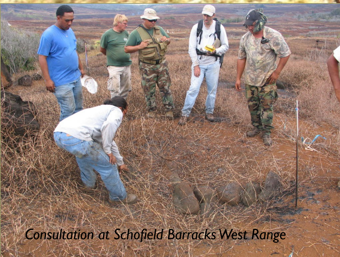
Consultation at Schofield Barracks West Range

The Army consults with Native Hawaiian Organizations and seeks recommendations on preservation