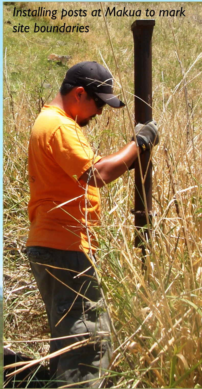
Installing posts at Makua to mark site boundaries