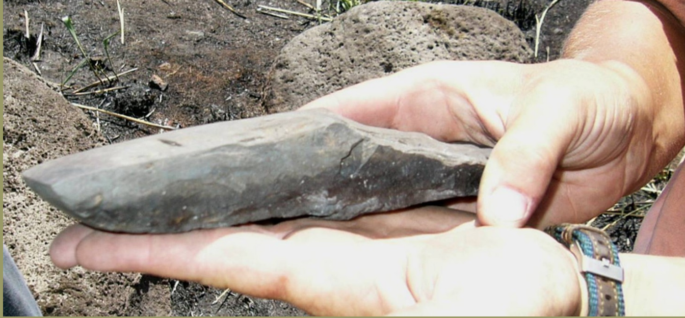
stone adze head