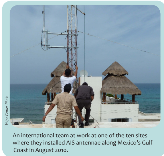
An international team at work at one of the ten sites where they installed AIS antennae along Mexico's Gulf Coast in August 2010.

In support of U.S. Northern Command (NORTHCOM) and the U.S. Department of Defense Counter-Narcoterrorism Technology Program Office and in collaboration with the U.S. Embassy in Mexico and SEMAR (Mexican Navy), Volpe Center engineers are providing technical expertise and system deployment support to enhance Mexico's maritime vessel tracking capabilities.