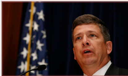
Aneesh Chopra U.S. Chief Technology Officer

The Volpe Center is a great example of an experiment in government that's worked. Every day, you collaborate within every mode within the Department of Transportation, as well as with the larger industry to give form, shape and direction to innovation. You are truly the laboratory of innovation.