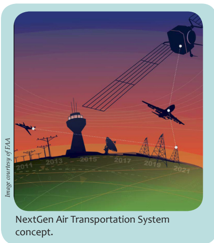
NextGen Air Transportation System concept.

New “E-enabled” aircraft -- such as the Boeing 787 and 747-8, Airbus 380 and 350, and the U.S. Air Force KC-X tanker -- are incorporating increasing amounts of non-classified technologies such as open standard internet communication protocols and commercial-off-the-shelf equipment that can add significant benefits in terms of aircraft efficiency and capabilities. The open nature of these systems raises concerns about the corresponding increase in cyber security vulnerabilities and threats to aircraft safety.