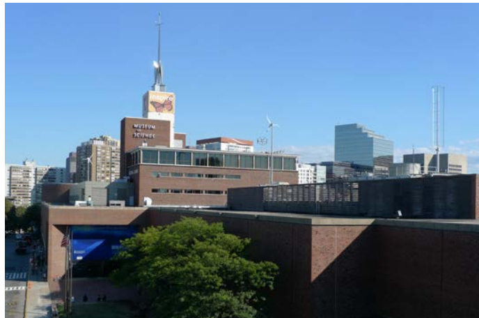
Figure 16. The Boston Museum of Science currently has five turbines in its Wind Turbine Lab.

In addition, BWT manufacturers can provide great value. For example, Cascade Swift and Quiet Revolution have knowledge of the wind resource in the built environment and how it affects their products. These and other manufacturers can provide input into best practices and provide partnerships for advanced turbine testing.