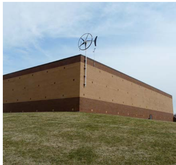
Figure 8. A SWIFT wind turbine at a municipality's Board of Public Works building.

Many of the safety issues pertaining to BWTs were addressed in the safety section, but additional concerns exist regarding hazards during BWT operation, installation, maintenance, and inspections. Servicing BWTs requires additional procedures due to the limited space in built environments, particularly rooftops. These can be addressed with knowledge of best practices and enforced through procedures.