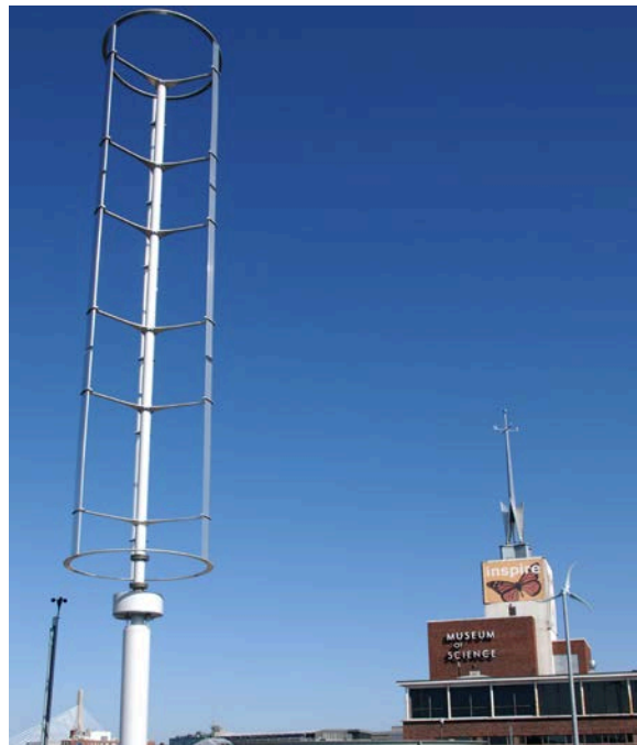
Figure 11. Windspire vertical-axis wind turbine at the Boston Museum of Science.

Cost of energy calculators exist and are widely used; however, they perform poorly in terms of predicting the cost of energy of turbines in complex terrain. Hence, their predictive capability in built environments is highly dubious. The existing cost of energy calculators must be modified and adapted for BWTs.