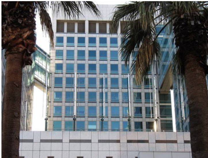
Figure 7. Windspires at Adobe Systems Inc., in San Jose, California.

Most, if not all, building codes do not specifically address BWTs. Searching for and complying with the existing applicable building codes could be daunting and expensive, and the outcome may not be favorable. The uncertainty of this process adds an additional barrier to the process of BWT code compliance.