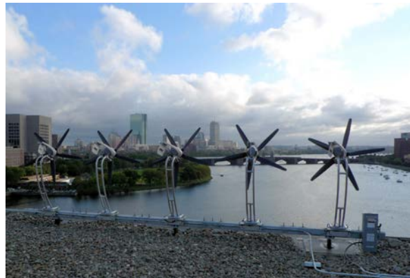
Figure 4. Example of roof-mounted BWTs at the Museum of Science, Boston, Massachusetts.

Ice-shedding and part-shedding incidents have been infrequent, but risks are present, and increased numbers of built-environment installations also increase the magnitude of these concerns. It is worth noting that parts and ice can be tossed long distances, and it is difficult to predict where they may land. Part-shedding cannot be predicted, but there must be a way to contain this safety hazard. Ice-shedding can be expected after an icing event, but no SWTs on the market automatically detect or respond to ice build-up.