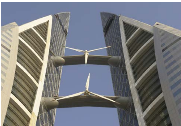
Figure 19. Building-integrated wind turbine at the Bahrain World Trade Center.

The majority of BWTs are roof-mounted SWTs (Figure 18) with a rated power of 10 kW or less (Wineur, 2005). For a conventional HAWT, this means a rotor diameter of less than approximately 7 meters (23 feet). Besides HAWTs, several VAWTs have gained public interest, and some manufacturers market their VAWTs for urban and suburban installations.