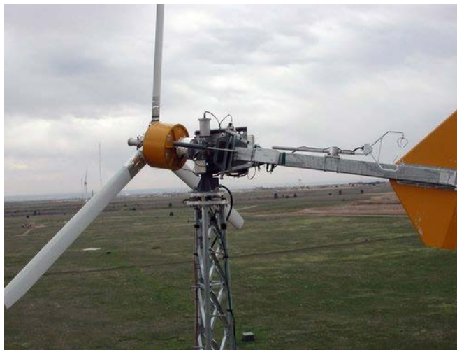
Figure 14. Bergey turbine outfitted with two three-dimensional sonic anemometers that measure wind speeds upwind and in the tail wake.

Wind speed and direction measurements should be in three dimensions, so sonic anemometers will probably be utilized. Any group with sonic anemometers and three-dimensional wind data in the built environment would be valuable. Coordination with built-environment modelers could identify optimum locations to deploy anemometers.