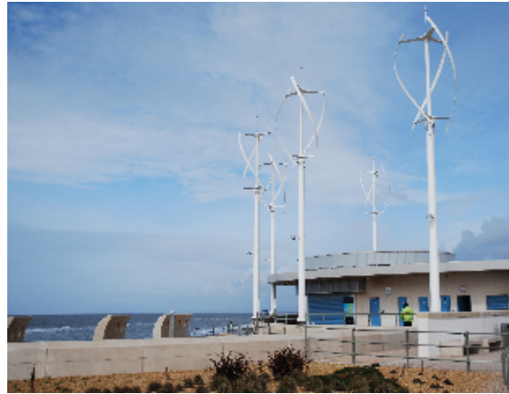
Figure 3. Quiet Revolution vertical-axis wind turbines at Cleveleys Promenade, United Kingdom.

VAWTs have two general topologies. They generate power through drag, such as the Savonius design, or they generate power through aerodynamic lift, such as the Darrieus design. It should be noted that the Savonius design is not purely a drag-driven machine because it is based on both drag and suction forces. The Savonius design has higher