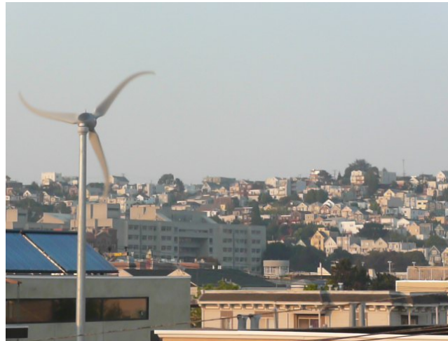
Figure 5. Skystream turbine in San Francisco, California.

Wind resource maps provide an estimate of the wind resource at different heights. Resource maps work reasonably well at heights well above the ground and far from obstacles. For SWT sites with good exposure to the prevailing wind directions and without major obstacles (such as groves of trees) within at least several kilometers, an