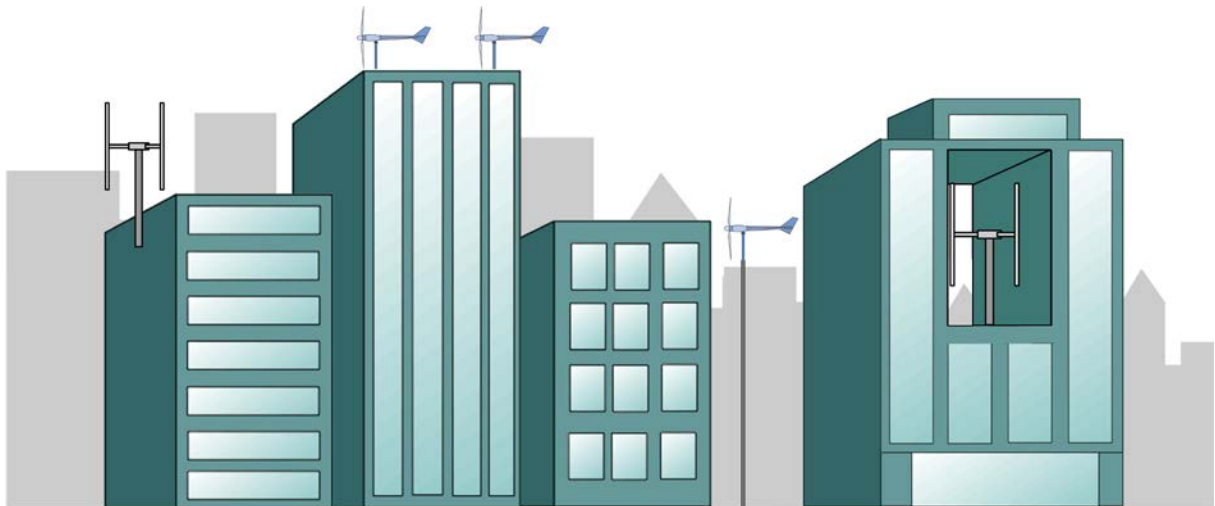
Figure 1. Examples of various BWT installations. Left to right: Side mounted to building, roof mounted, ground mounted in the built environment, building integrated

To date, most wind turbines installed in the built environment have been sited with limited understanding of or regard for the unique challenges of BWTs (Encraft 2009). Most SWTs were designed for rural areas, not the built environment with its high turbulence, lower average wind speed, more frequent wind direction changes, and potentially higher vertical inflow. Nor were turbines designed to be in close proximity to people, businesses, and other property. Poor siting and improper use of BWTs could lead to turbine failure, possibly resulting in injury, property damage, and potential liabilities. These liabilities extend to not only BWT owners but also to the industry, which would suffer from general negative perceptions of wind technology.