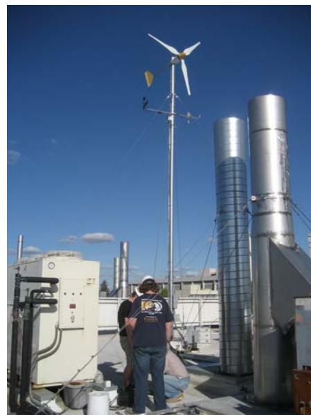
Figure 2. Students at the University of California - Davis work on a roof-mounted Bergey wind turbine.

The poor quality of SWT installations completed without professional consultation is particularly apparent in BWT installations (Encraft 2009). These installations are often located in areas where the wind is blocked or diverted by