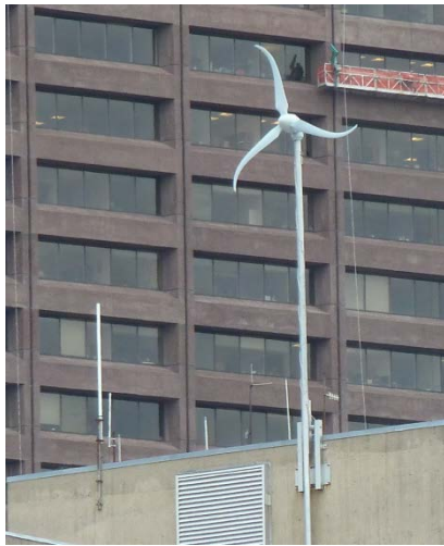
Figure 17. Building-mounted (side) wind turbine at the Boston Museum of Science.