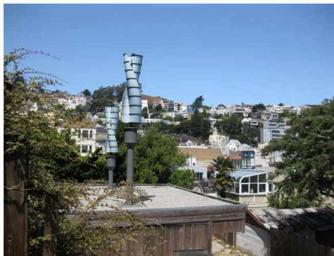
Figure 13. An example of a roof-mounted vertical-axis wind turbine in San Francisco.

A BWT reliability database should provide a central location for logging all BWT failures. By tracking failures, this database could be used to identify issue patterns, minimize repeated similar mistakes, and improve designs and design requirements. This database could be made public, limited access could be granted, or a combination of both could be implemented. It is expected that it will be used by owners, policymakers, installers, and manufacturers. Although each group will have its own database need, the goal is to improve BWTs' safety and quality.