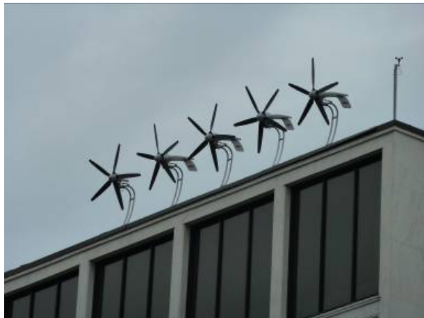
Figure 9. BWTs at the Boston Museum of Science.

Analysis of existing data can provide a picture of the BWT market as a whole. This could be useful for policymakers, manufacturers, and investors to understand where and why BWTs are being installed.