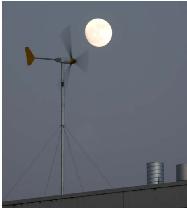
Figure 12. University of California - Davis Bergey wind turbine. The university is conducting BWT research.

The following table summarizes medium-term actions that will require effort in approximately 4 to 7 years and the BWT barriers addressed.