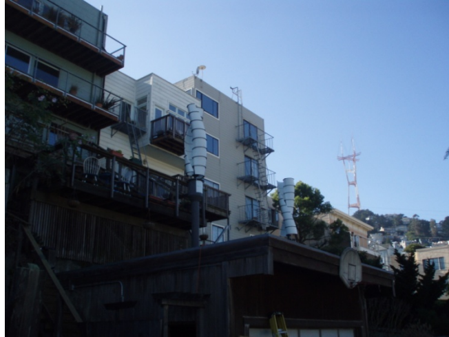
Figure 15. An example of a vertical-axis wind turbine in San Francisco.

The NWTC is also an ideal place for research and development. This is important in researching BWT safety concerns such as fail-safe design, braking redundancy, ice throw and parts-shedding, and shortened turbine life due to high fatigue.