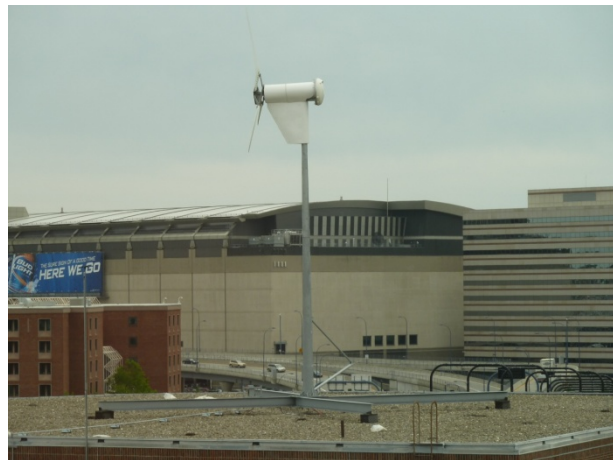
Figure 18. Building-mounted (roof) wind turbine at the Boston Museum of Science.