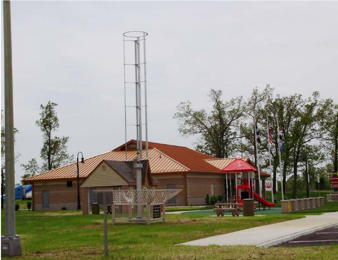
Figure 10. A Windspire vertical-axis wind turbine in the built environment.

There are several methods for modeling and predicting built-environment wind resources. CFD and wind tunnel testing are often cited. Of particular interest are field experiments to study flow in an urban environment in the context of Atmospheric Transport and Dispersion of contaminants.