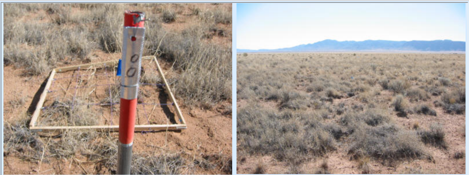
Figure 3. Example photographs of study plots taken at the SEVI site on May 21-29, 2002. Left photo is Plot 0, Subplot 1 (center) and right photo is Plot 0, Subplot 3 (east). Photos of plots and subplots are available for SEVI and TUND sites as companion files.