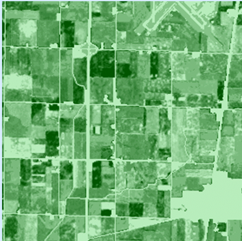
Figure 1. Example of .tif file provided for LAI (leaf area index) data. This is an image of LAI from August 11, 2000 at the AGRO site (bf_agro_lai_aug_11_2000_x10_them_with_defaults.tif). For detailed information about the *.tif files provided for LAI and Landcover at selected sites, please refer to the site-specific Measurement Documentation referenced in Table 1.