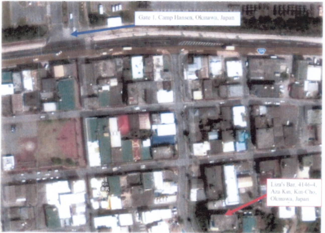
Gate 1, Camp Hansen, Okinawa, Japan