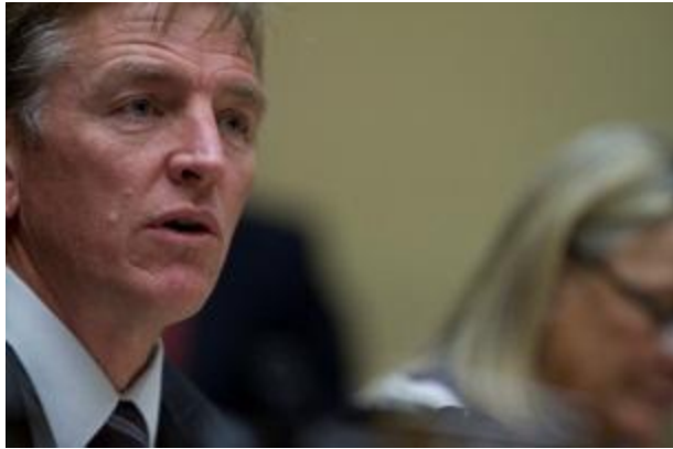
Rep. Gosar has continuously demanded accountability from AG Holder

These proceedings come after continuous delay by Holder and the Department of Justice to release subpoenaed documents from the reckless Operation Fast and Furious.