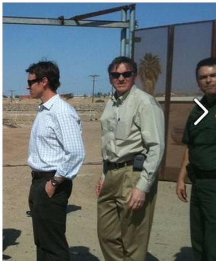
Congressman Gosar visits the border