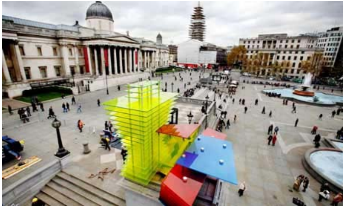
Model for a Hotel Glass architectural model November 2007 – May 2009