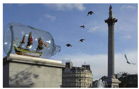
Nelson's Ship in a Bottle Commemorates the Battle of Trafalgar May 2010 - Present