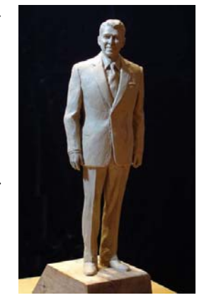
Model of Ronald Reagan statue to be installed at U.S. Embassy

The policy also establishes a "10 year principle" following an event or death of an individual before approving a permanent commemoration in order to "allow partisan passions to cool and enable sober reflection, allow time for the careful selection of a site, for the raising of funds, and for commissioning of the best possible piece of work." Although exceptions have been granted (e.g. the Ronald Reagan monument approved in 2009 for location in front of the U.S. Embassy<sup>6</sup>), the City typically prefers a temporary memorial, such as an event or planting within an existing garden, until ten years have elapsed.