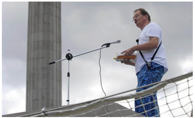
One & Other 2,400 individuals were given one hour on the plinth for an activity of their choice, broadcast online in real-time, July – October 2009